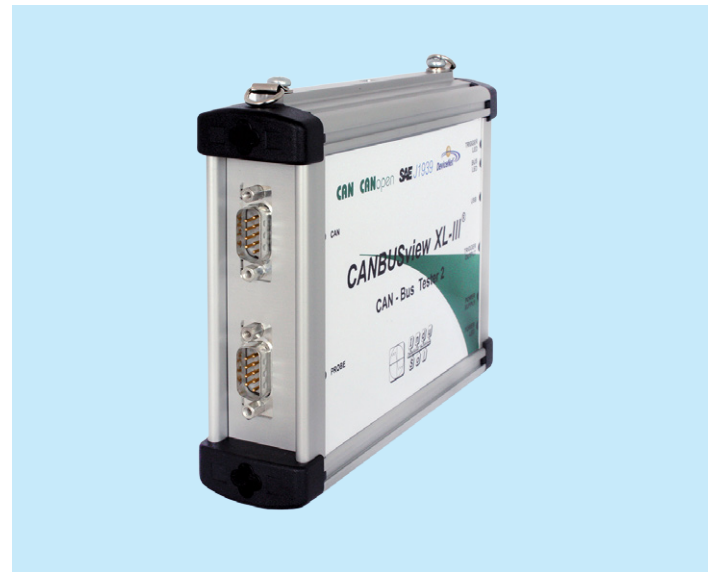
CANBUSview XL III

Parallel to the physical transfer quality determination the CANBUSview XL checks the telegram traffic for defective telegrams, missing acknowledgements and overload of bus devices as well as the general bus capacity utilization. The online trigger is used to analyse the communication quality over several days / weeks. This helps to detect sporadic communication faults and allocate the same to a certain period of time. The online trigger is capable of analysing physical and logical faults.