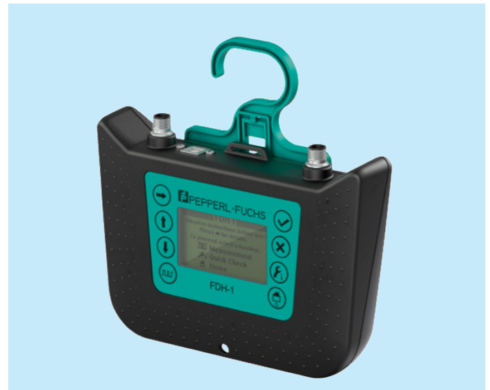
Fieldbus Diagnostic Handheld FDH-1