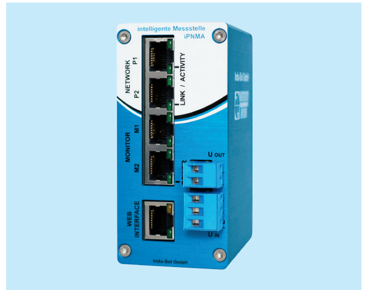
Intelligent Measuring Point iPNMA

For integrating the intelligent PROFINET measuring point into the PROmanage® NT software, 16 licensed ports are required for each iPNMA.